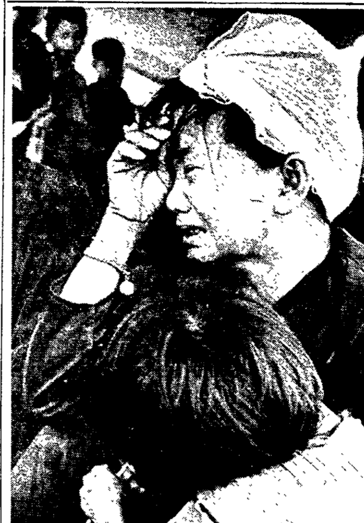
LOSES HOME—A South Vietnamese woman weeps as she holds her daughter in a refuge staging area after they were evacuated from their home in the Kylo Valley near Tuy Hoa, South Vietnam. South Korean troops on Operation Hong Gil Dong, evacuated the villagers to a camp at Song Cau. (AP Wirephoto)

PITTSBURGH, Pa. (AP) — A deer was killed Sunday when it ran in front of a jet airliner landing at Greater Pittsburgh Airport. The plane, flight 69 from New York, landed safely, though it had to have a hydraulic line replaced in its landing gear.